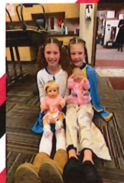
All Saints Day Celebrations

Our students had a wonderful time celebrating All Saints Day! Each child chose a favorite saint to dress up as and shared fun facts about their life and faith. It was a beautiful reminder that we are all called to holiness and can look to the saints as examples of how to live with love, courage, and devotion to God. What a joyful day of faith and learning!